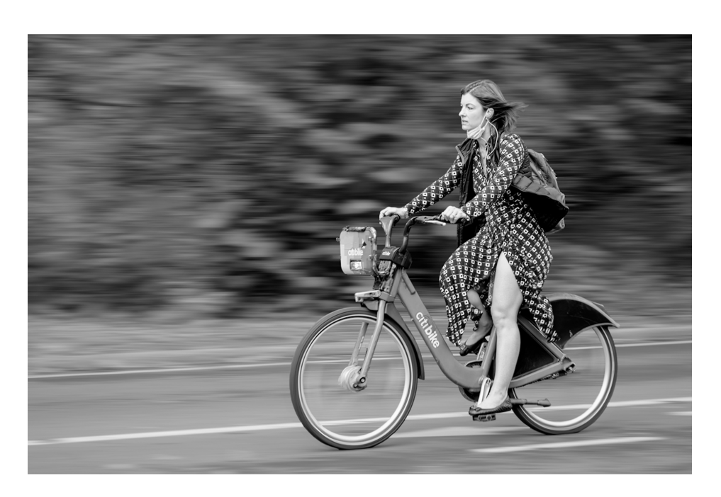
Thrird Place Monochrome "Daily Commuter" By Goutam Sen