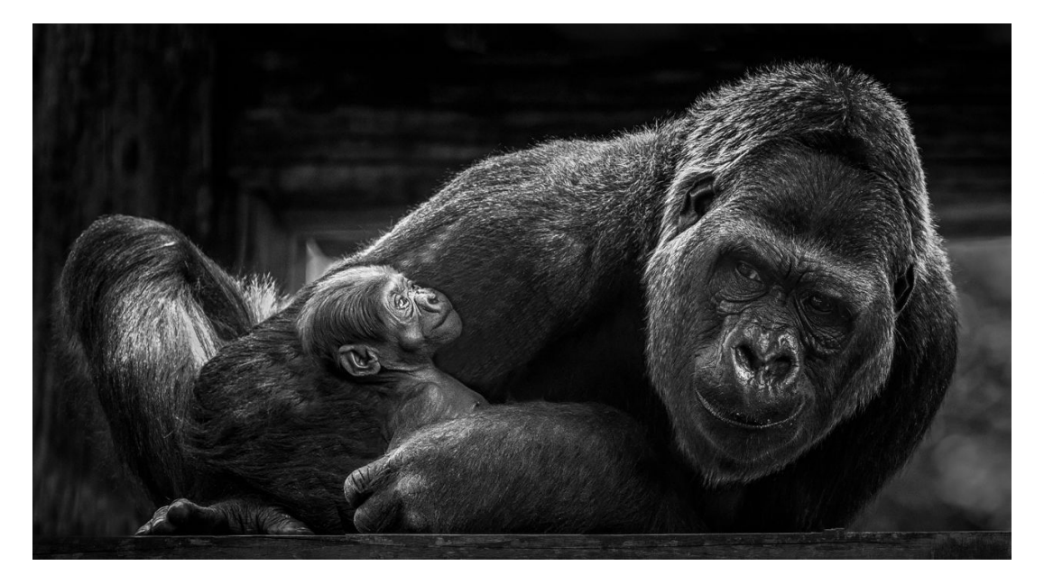
First Place Monochrome "My Baby" By Goutam Sen